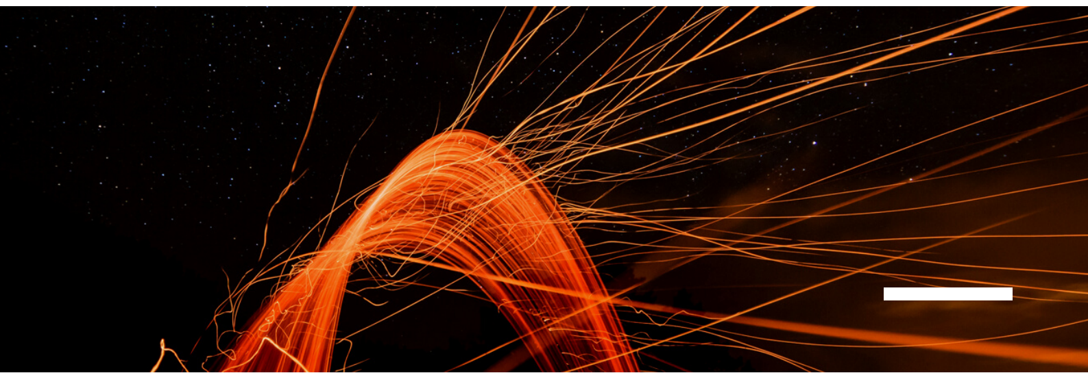
MyFREJA shipment dimension